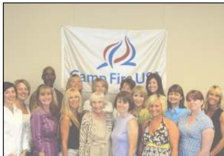
The staff at Camp Fire USA.

Camp Fire USA New Jersey Council is looking forward to working with City of Angels in building the foundation as we bridge the gap from prevention to intervention to treatment and recovery...covering the